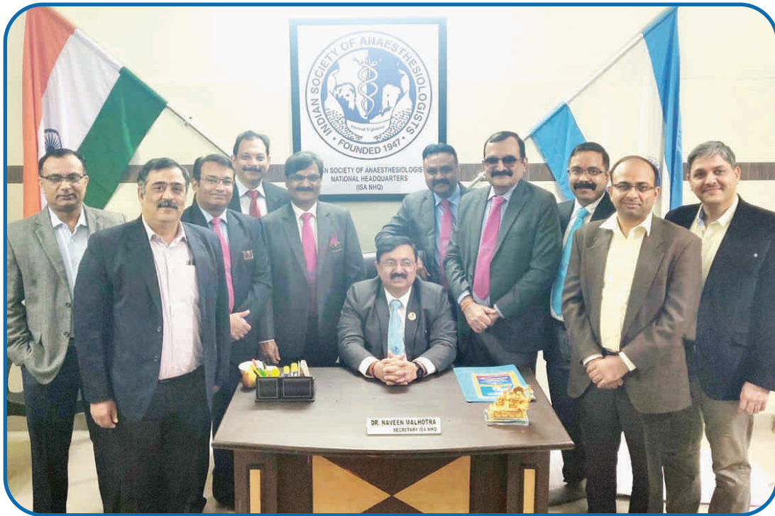
Inauguration of ISA National Head Quarters, Rohtak, Haryana (27 January 2019)