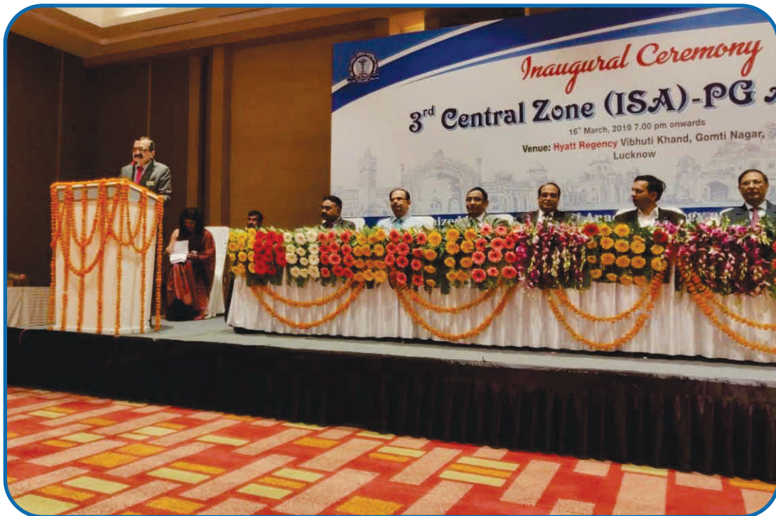
ISA Sponsored Central Zone PG Assembly, Lucknow, Uttar Pradesh (16 March 2019)