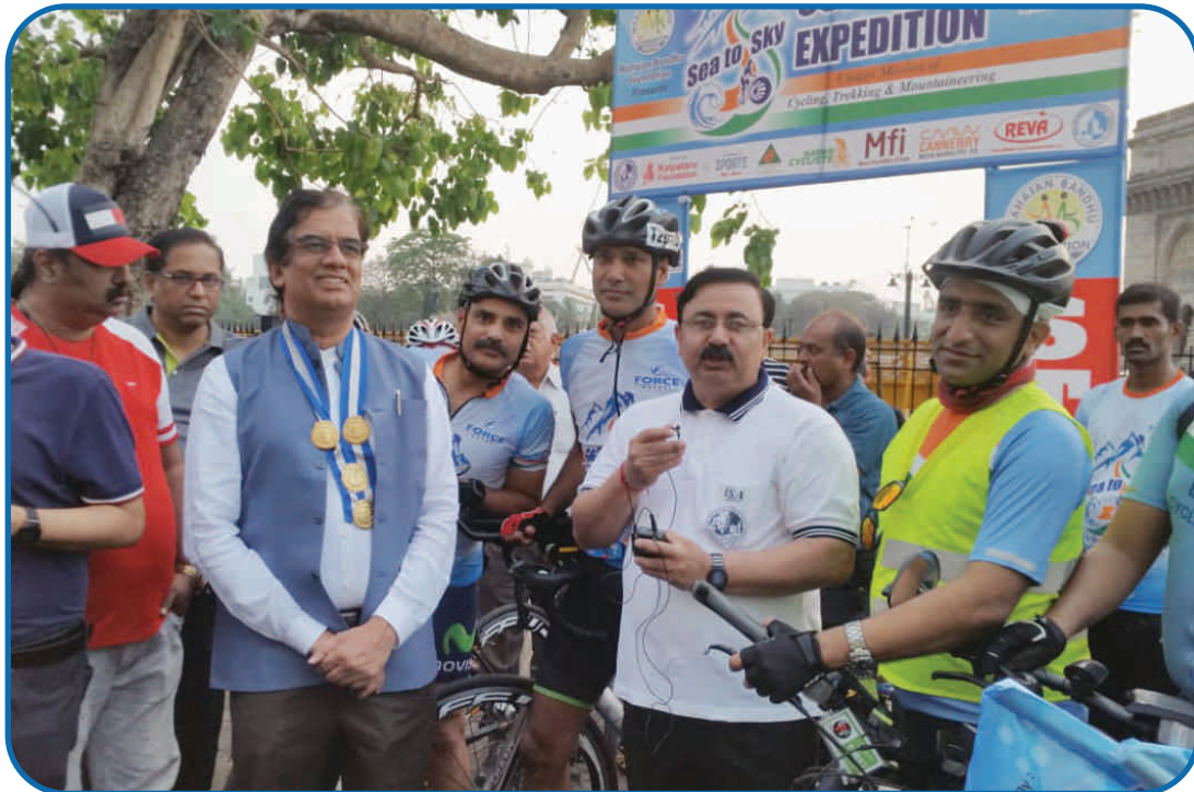
Flagging Off of Sea to Sky Mission, Mumbai (31 March 2019)