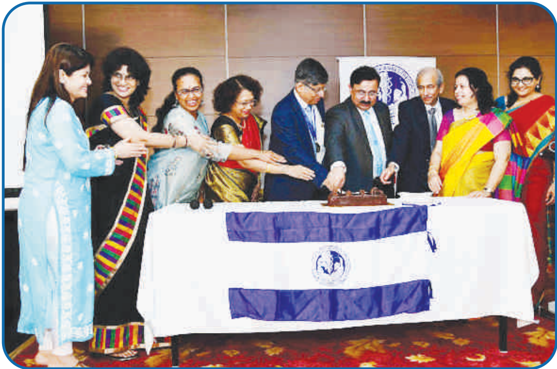
Annual Day Celebration, ISA Thane City Branch, Maharashtra (31 March 2019)