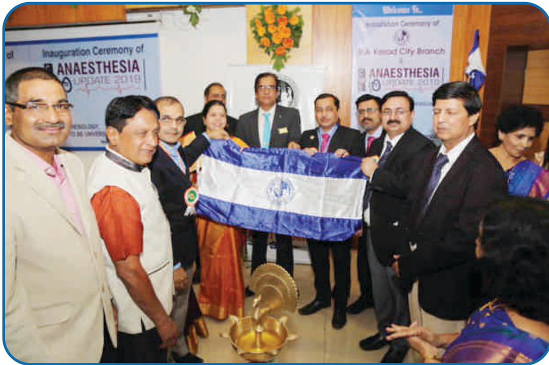
Inauguration of ISA Karad City Branch, Maharashtra (10 March 2019)