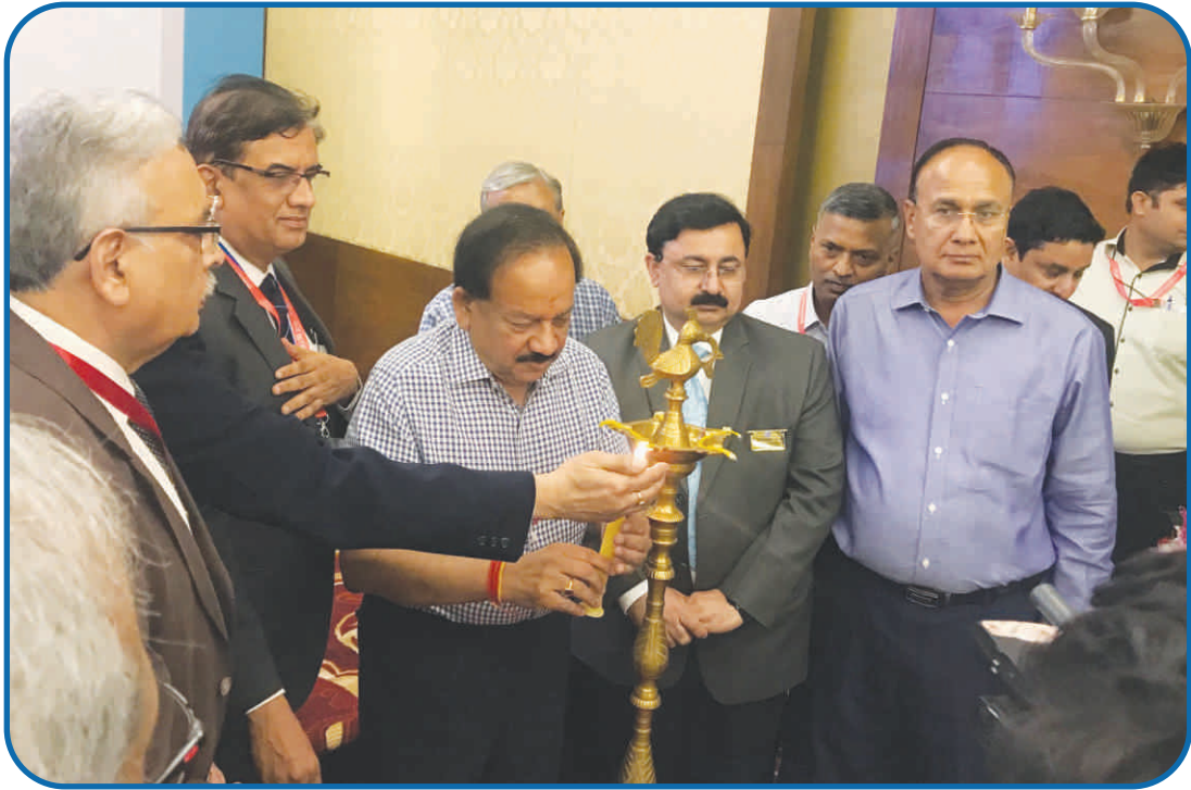
Inaugural Ceremony, ISA Delhi State Chapter Annual Conference, Delhi (13 April 2019)