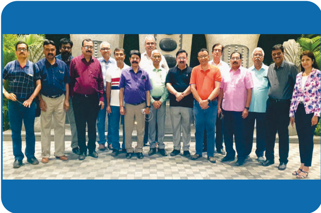
ISA Vadodara City Branch Meeting with ISA National Governing Council (22 March 2019)