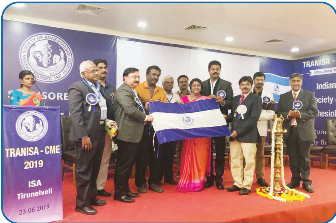
ISA Sponsored CME, Tirunelveli, Tamil Nadu (23 June 2019)