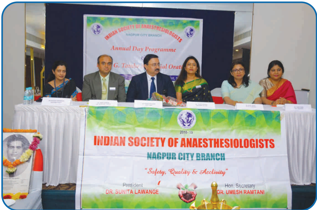
Annual Day Celebration, ISA Nagpur City Branch (14 January 2019)