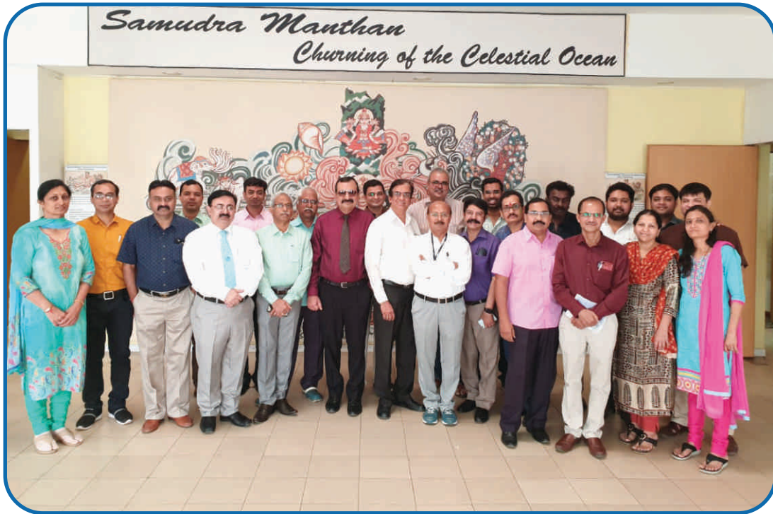
ISA Nadiad City Branch Meeting with ISA National Governing Council (22 March 2019)