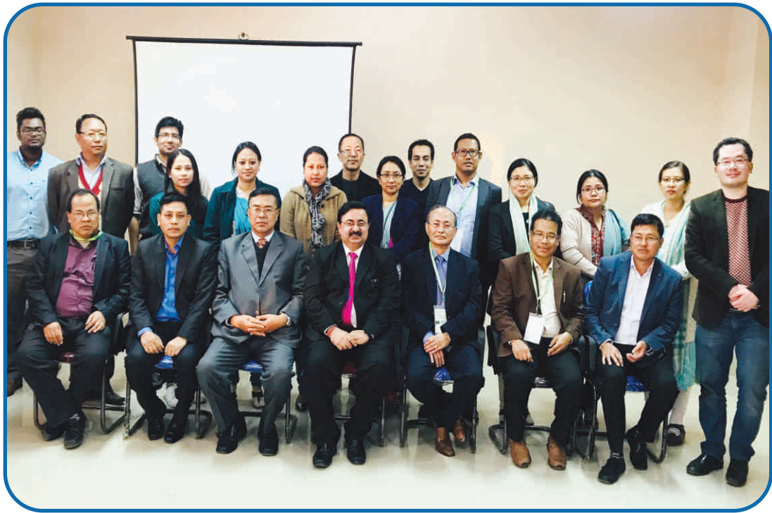
ISA Manipur State Branch Meeting, Imphal (29 December 2018)