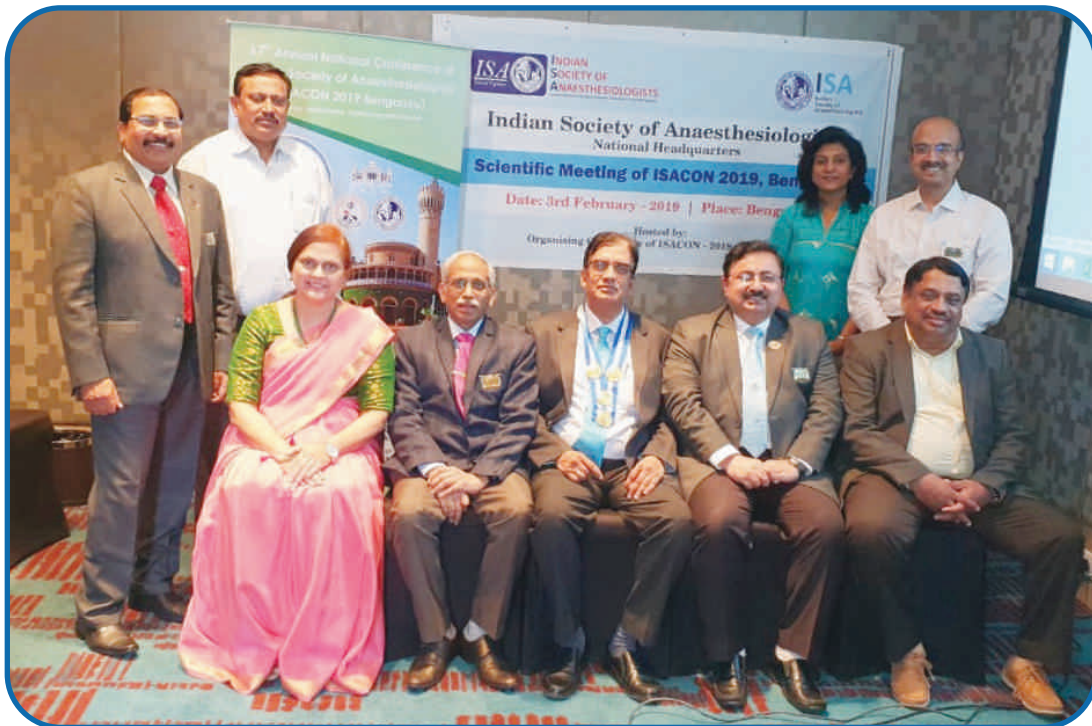
ISA Scientific Committee Meeting, Bengaluru (3 February 2019)