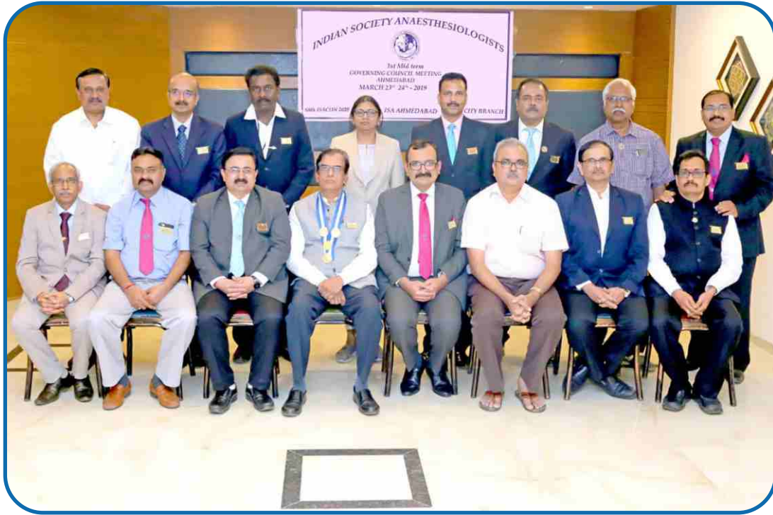
First Mid Term Meeting of The Governing Council of ISA, Ahmedabad (23-24 March 2019)