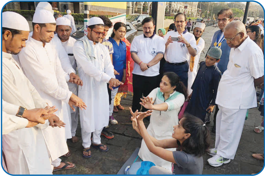
COLS Program, Gateway of India, Mumbai (31 March 2019)