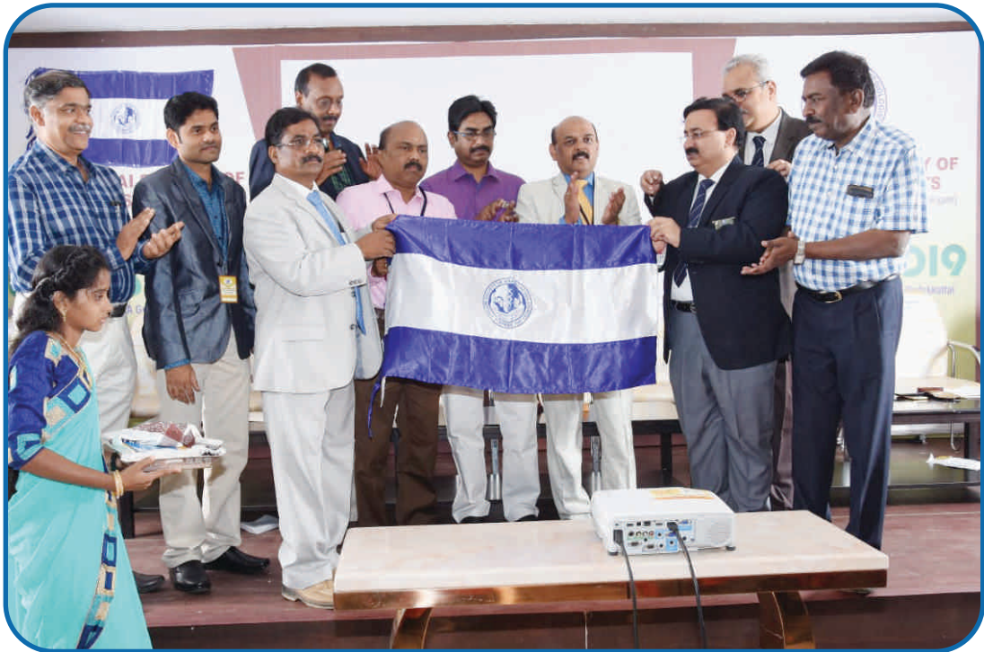
Inauguration of ISA Pudukkottai City Branch, Tamil Nadu (19 May 2019)